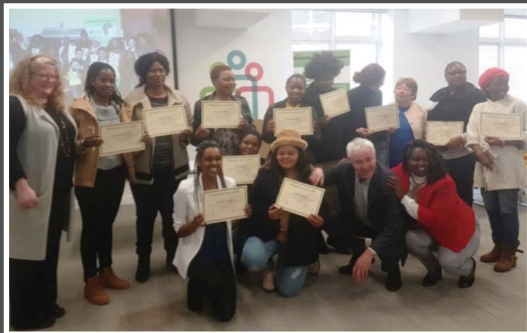
WISE programme graduates receiving their certificates.