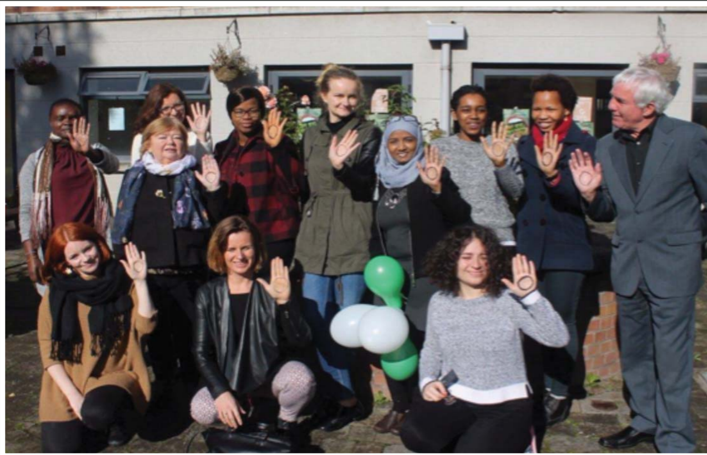
Beginning of Women in Social Engagement (WISE) project by Partners in Catalyst.