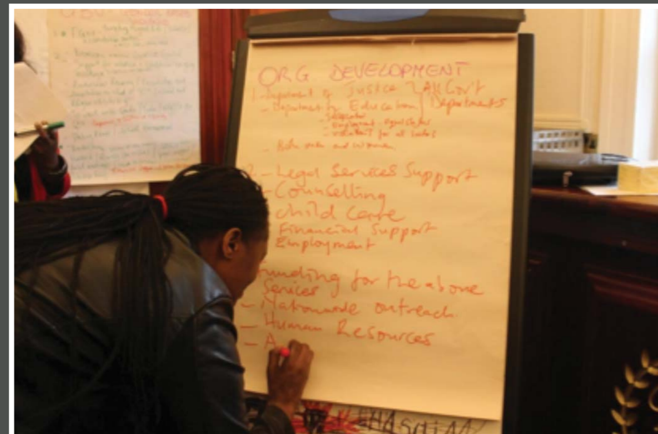
Brainstorming session at AkiDwA AGM 2018.

The Annual General Meeting was held on the 1st of December 2018 at Wynn's Hotel, with the theme Shaping the Future. Members, friends and supporters came from all corners of Ireland to learn about our achievements, challenges, and plans for the future.