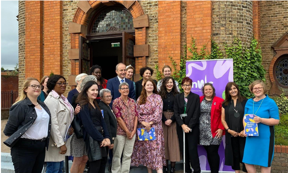
All Women Rally