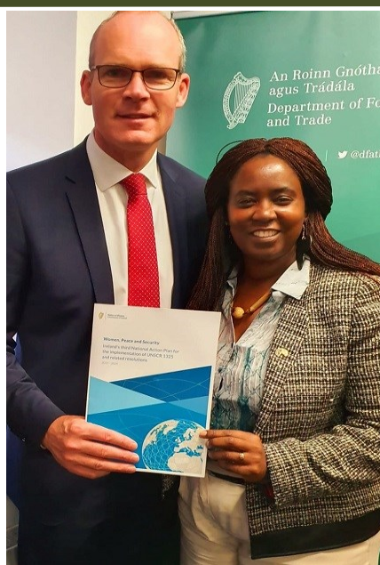
In Belfast for the launch of Ireland's National Action Plan to put Women Peace & Security at the heart of government policy.

AkiDwA has been running a program of sexual & reproductive health (SRH) workshops for women in direct provision centres since July 2018. The objective is to provide women in Direct Provision Centres with information on sexual & reproductive health and to link women into local and regional health services. AkiDwA's SRH workshops have been funded by the HSE's Crisis Pregnancy Programme and will run until December. We reached 225 women in 17 accommodation centres across the country last year and in 2019 we expanded the program to include workshops for men living in ten centres. From July to September 75 migrant women attended sessions with our Women Support Officer Nenette Bouithy in centres in Mayo, Sligo, Tipperary, Kildare, Kerry and Wicklow.