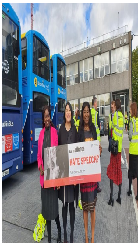
Working together to tackle hate crime