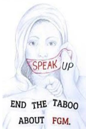
We used art to talk about the trauma of FGM